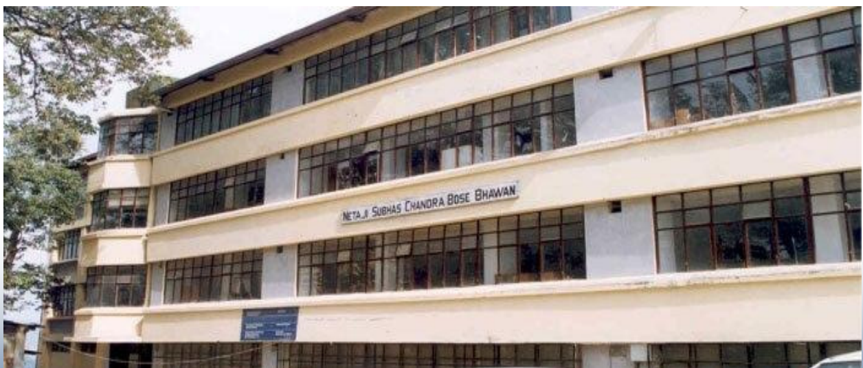
The UIIT main block